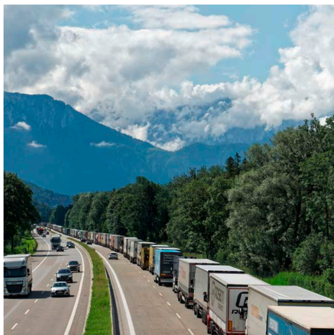
The motorway in the Inn valley is highly congested. With the Brenner northern access route, we are enabling more environmentally friendly transport by rail.

Good local transport is important for the region. The main links take passengers to Munich, Kufstein and Salzburg. More capacity will be added to the existing tracks when the new line is built, creating space for more trains that are reliable and on time.